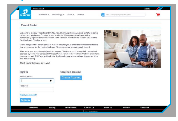
Step 3: Enter your school's code: BFAZQFZJ

Step 4: Choose the appropriate grade level. Note that your school may have selected textbooks that are higher or lower a grade based on which courses they are taking. Please note any instructions your school has posted.